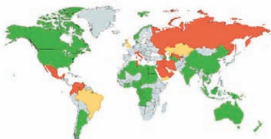
Figure 1. Annual statistic report on world reserves: crude production quality based on data from 2015

Whether it is oil or gas bearing, conventional or unconventional, when a field contains H 2 S above a certain value it is qualified as sour. Even though it presents several difficulties, the development of sour (rich in H 2 S and CO 2 ) oil and gas fields is quickly emerging as a major industrial and technological theme. Such interest for sour resources arose because of two main factors: first, the diminishing accessibility of easy-to-produce conventional oil and gas makes attractive also the development of high H 2 S fields; second, there has been an increase of operations in areas traditionally rich in sour resources like Russia and the Middle East (Figure 1).